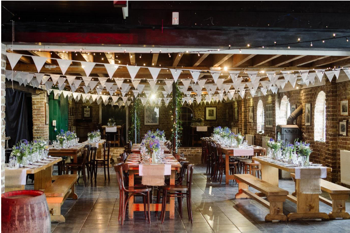
Kent Life – 30 th January 2017

East Quay is at the end of the east quay harbour, facing outward onto the shingled beach of Whitstable. The venue can accommodate up to 100 guests for the ceremony and drinks reception, offering couples a variety of options for the latter, including the famous oysters which guests can enjoy on the beach. Couples can also opt for a wedding breakfast, which can be tailored accordingly. All produce is locally sourced, including the fish caught by local fishermen who work on the harbour. In-house catering is offered by the venue, although couples may bring their own home-made or catered evening buffets. The venue also offers extras including ice-cream bikes, candyfloss makers and popcorn machines to ensure you have the ultimate seaside wedding.