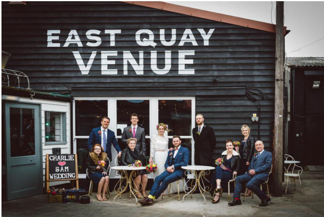
(East Quay Venue)

If sea views make you weak at the knees look no further than East Quay Venue ; one of Whitstable Harbours oldest buildings which used to be an Oyster house. Expect relaxed shabby-chic beachfront style and an authentic seaside atmosphere.